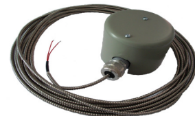
SE-012 with Armored Cable